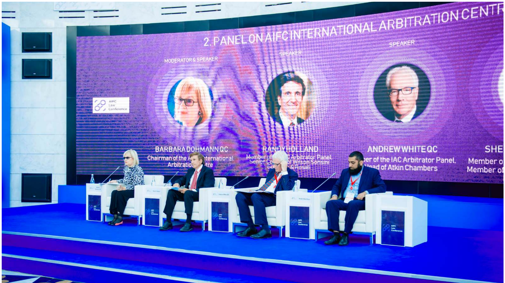
AIFC Law Conference July 2018