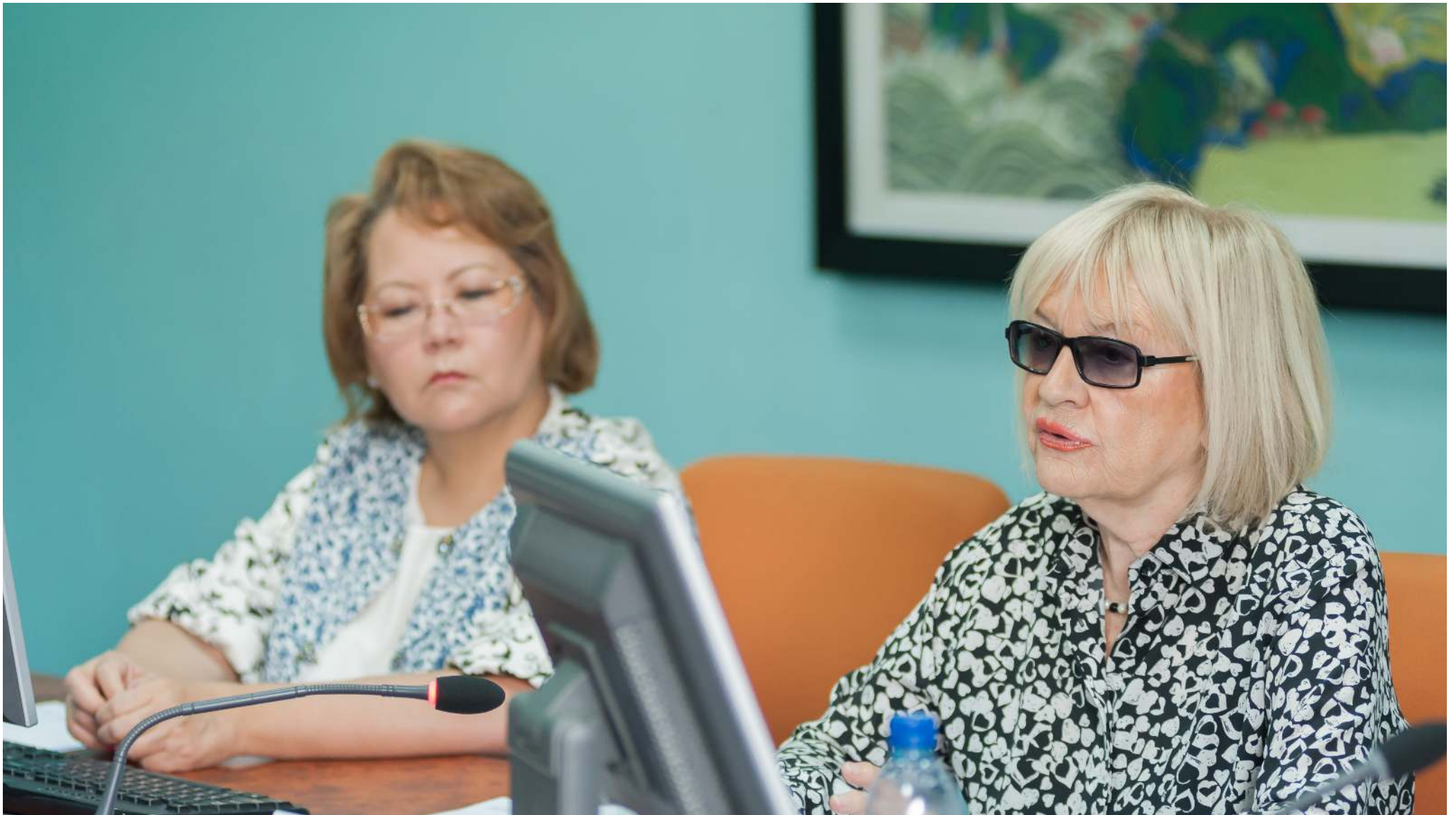
Roundtable with Kazakhstan Bar Association June 2018